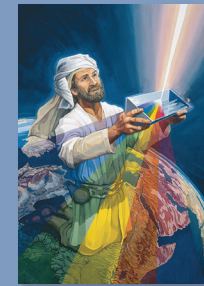
Pronouncement of a Destiny