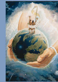
Creation and Its Concepts

Images as Teaching Tools: Lessons are paired with symbolic visuals to add meaning to the text.