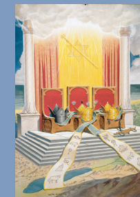
The United Kingdom